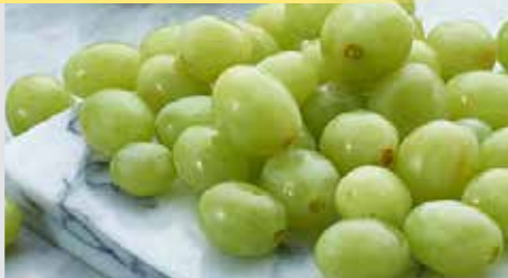
Sweet Seedless Green Grapes