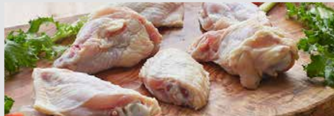
Grade A Chicken Party Wings