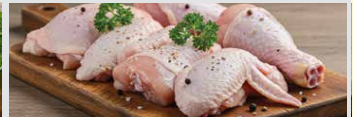
Grade A Whole Cut Up Chicken