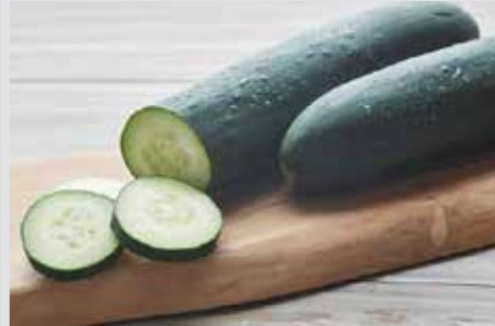
Super Select Cucumbers