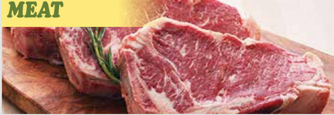
USDA Prime Beef Bone In Shell Steak