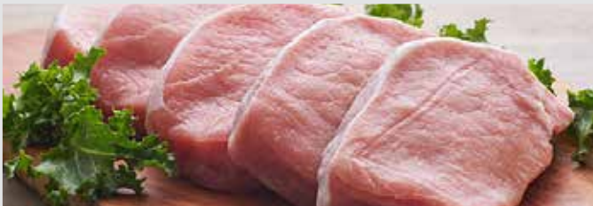
Center Cut Boneless Pork Chops