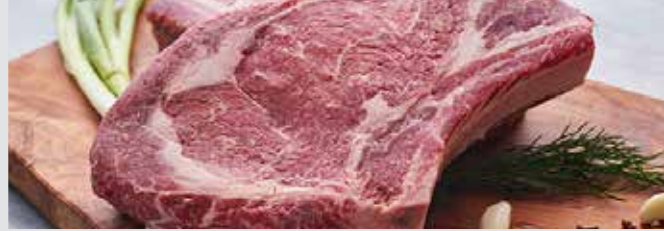
USDA Prime Bone In Rib Eye Steak