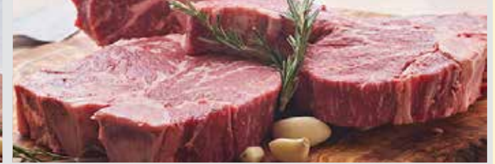
USDA Prime Beef Porterhouse Steak