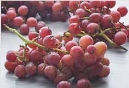
Sweet Seedless Red Grapes