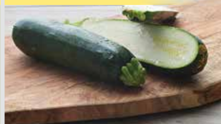
Fresh Green Squash