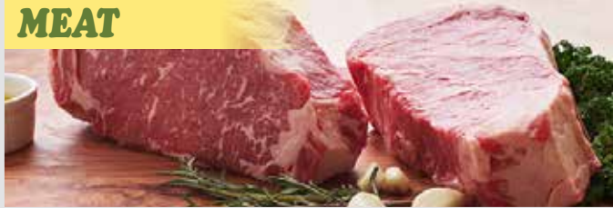
USDA Prime Beef Boneless Shell Steak