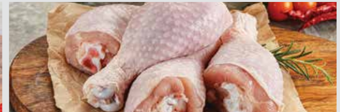
Grade A Chicken Drumsticks