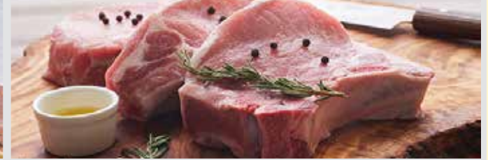
Center Cut Bone-In Pork Chops