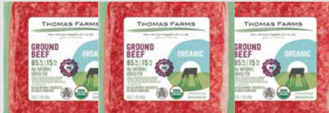
Thomas Farms Organic 85% Lean Grass Fed Ground Beef