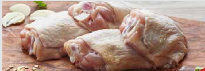
Grade A Chicken Thighs