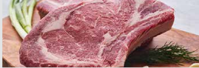
USDA Prime Beef Bone In Rib Eye Steak