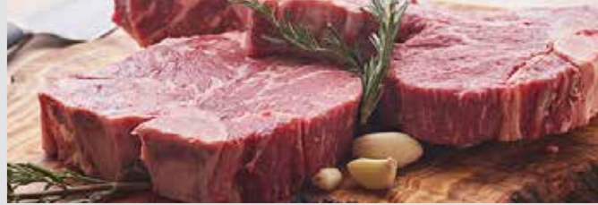
USDA Prime Beef Porterhouse Steak