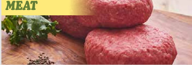
Christina's Epicure Hand Made Sirloin Burgers