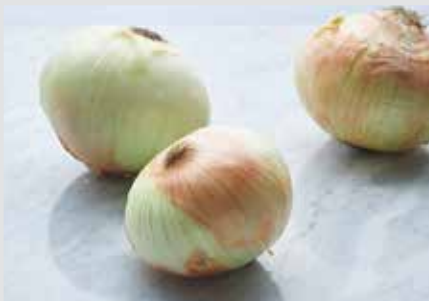
Sweet Vidalia Onions