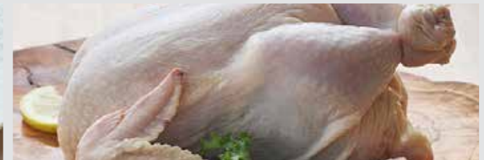
Grade A Whole Chicken