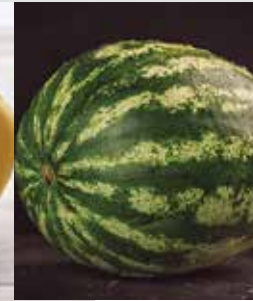
Yellow Bananas Or Whole Watermelon Whole Only