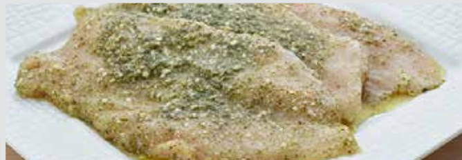
Grade A Marinated Chicken Cutlets