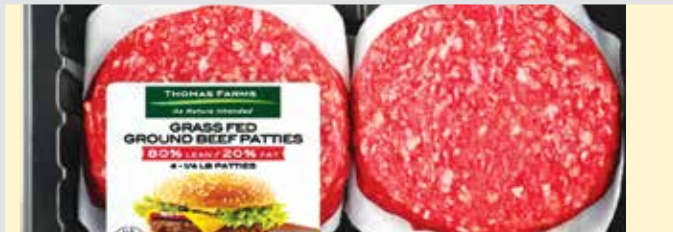
Thomas Farms Grass Fed Burgers