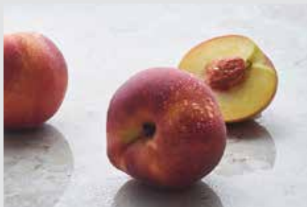
Sweet Loose Yellow Peaches